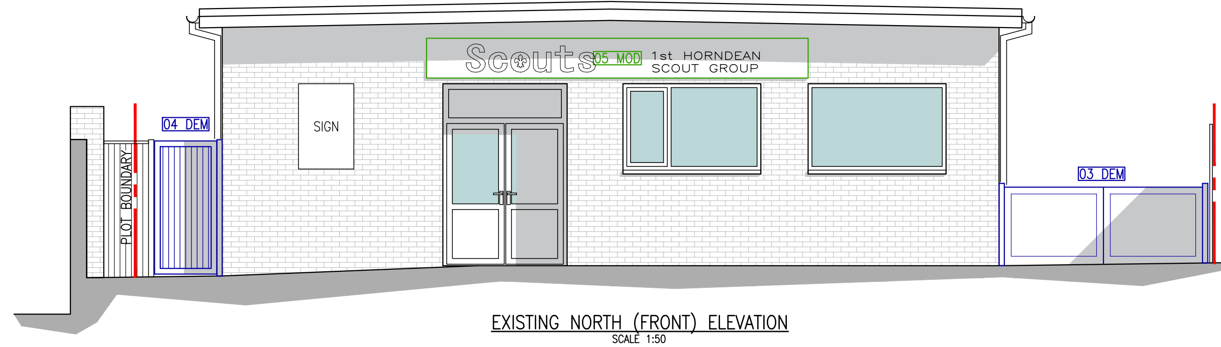
EXISTING NORTH (FRONT) ELEVATION SCALE 1:50