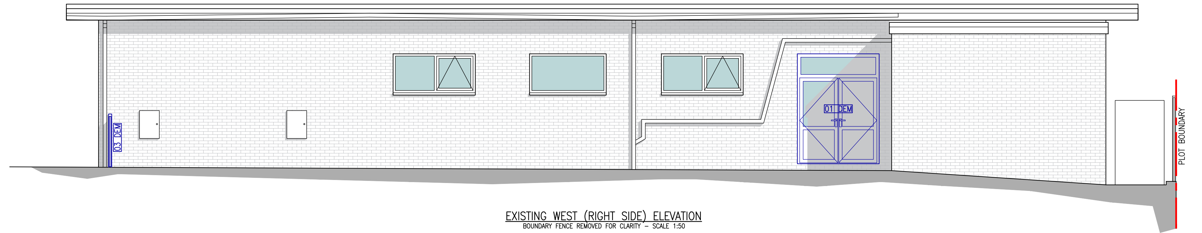
EXISTING WEST (RIGHT SIDE) ELEVATION BOUNDARY FENCE REMOVED FOR CLARITY - SCALE 1:50